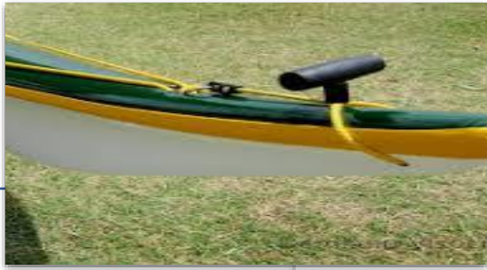
Decklines: 5mm min with integrated carry handles