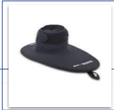
Spray deck must have release loop