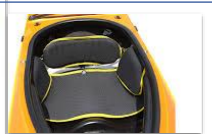
Minimum volume cockpit with correct outfitting