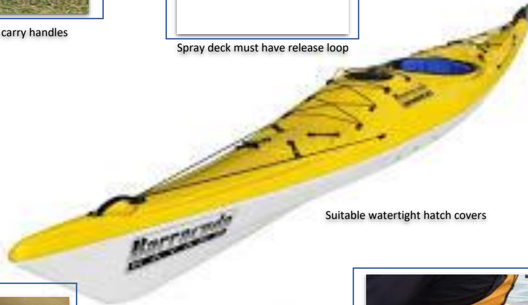
Suitable watertight hatch covers