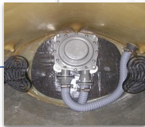
Hands free pump - electric or foot operated