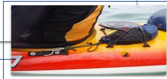
Tow point with quick release. 15m tow line.